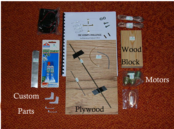
2-Leg Robot Kit